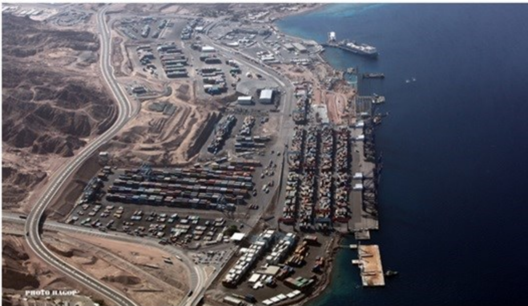
ACT - Aqaba Container Terminal (Total Surface 55 Hectares)

The Aqaba Container Terminal Pvt. Co. (ACT) is a world class port, serving as a major gateway for transit cargo moving to and from countries in the region as well as for the Jordanian market. It is situated at the cross road of 3 continents and 4 countries, Aqaba enjoys an attractive location in the heart of the Levant and caters to more than fifteen of the world's top shipping lines. APM Terminals, a global port operator and part of the well-known A.P. Møller – Maersk Group, manages, operates and markets the terminal in a partnership with the Aqaba Development Corporation. ACT is committed to providing a world class service to its customers and continuously aims to optimize facilities, technology and productivity. We have been nominated on several occasions as one of the best service providers in the region and collected several international awards.