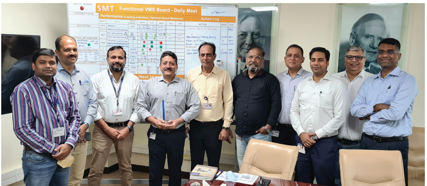
APM Terminals Mumbai [GTI] received the WoW terminal of the year award in our Asia Regional Annual Awards 2021.